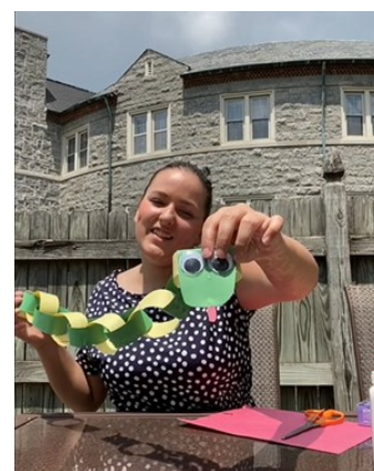
Adventure Ashton teaching Week One's craft, the snake.