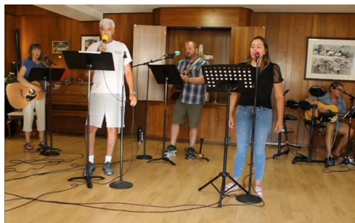
Zion's praise team singing the theme song for "Wild About Jesus" Vacation Bible School, "All God's Critters Got a Place in the Choir."